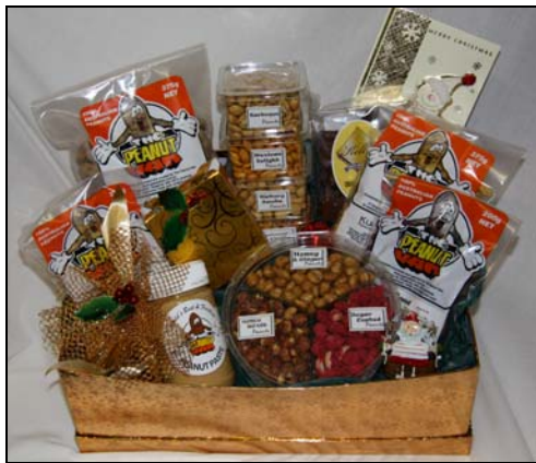
Just a part of our 2009 range of Christmas hampers